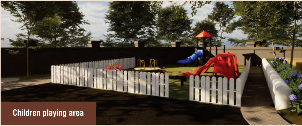
Children playing area