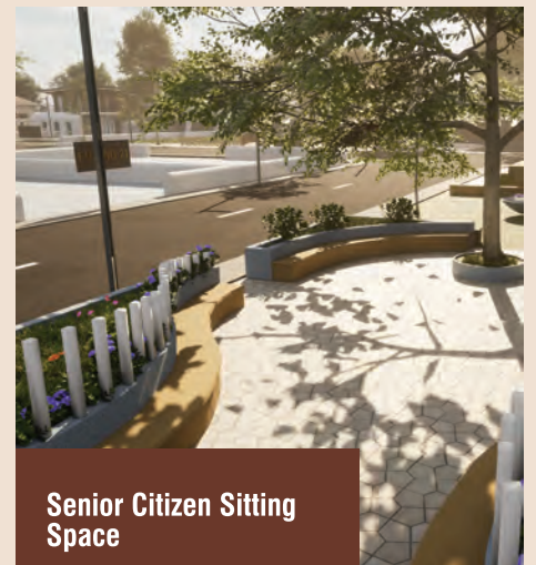
Senior Citizen Sitting Space